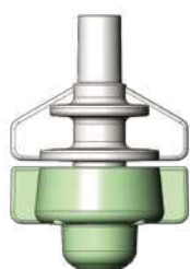
CoolNet™ PRO SINGLE